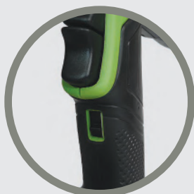
LOCK TRIGGER LOCK TRIGGER