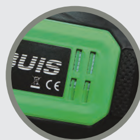
WEATHER RESISTANT PROTECTIVE MEMBRANE ALLOWS ELECTRONICS TO BE VENTILATED WHILE KEEPING WATER, DUST, AND MUD OUT OF THE CRIMPER.