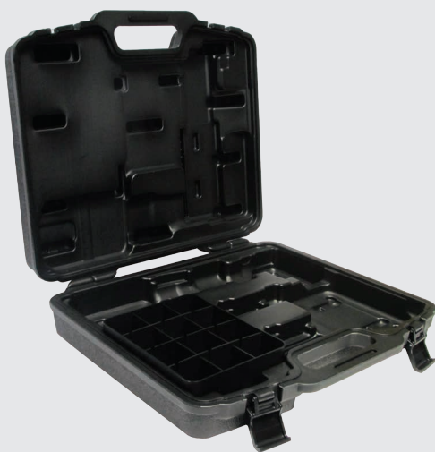
CASE FOR BPL-BCL INLINE TOOLS

To protect and carry the tool, case could receive the tool with its battery, an extra battery, a charger and dies.