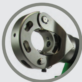
CRIMPING HEAD 9 AVAILABLE OPTIONS