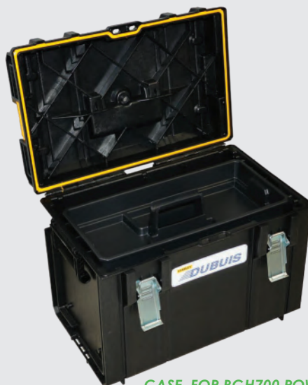
CASE FOR BGH700 POWER PACK BGH700

To protect and carry the tool, case could receive the tool with its battery, an extra battery, a charger and dies.