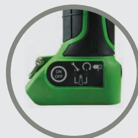
ON/OFF BUTTON WITH EMERGENCY SAVING FUNCTION PLI DISPLAY PANEL FOR: • BATTERY CHARGE LEVEL • CYCLE CONFORMITY • MAINTENANCE