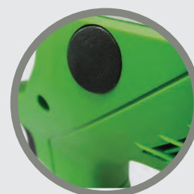
HAND RELEASE BY EMERGENCY BUTTON