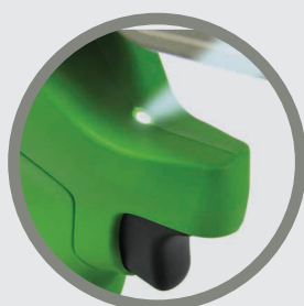
LED LIGHTING OF THE WORKPLACE