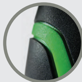
ROBUST PLASTIC HOUSING WITH RUBBER GRIP