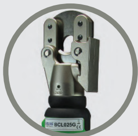
CRIMPING OR CUTTING HEAD 6 AVAILABLE OPTIONS