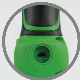
USB CONNECTION SOFT FOR DATA ANALYSIS & PREVENTIVE MAINTENANCE