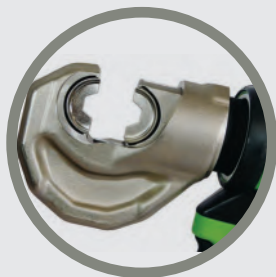
HEADS FOR ANY JOBSITE 11 AVAILABLE OPTIONS