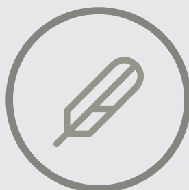
LIGHT & COMPACT