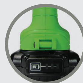
STANLEY 18V 2.0Ah OR 5.0Ah LI-ION BATTERY MORE AUTONOMY POWER LIGHT INDICATOR