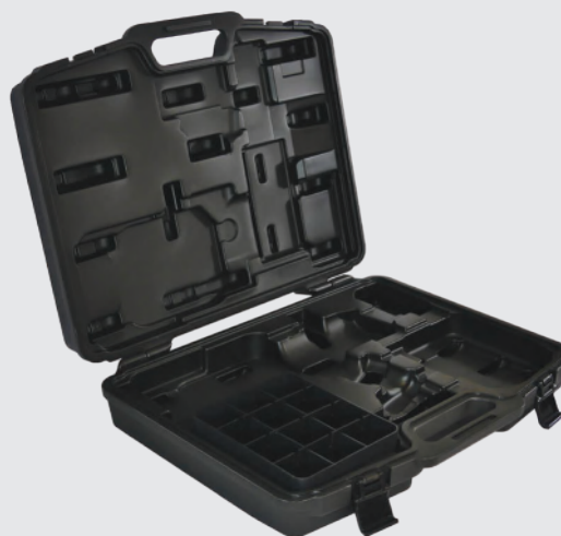
CASE FOR BPE -BCE PISTOL TOOL

To protect and carry the tool, case could receive the tool with its battery, an extra battery, a charger and dies.