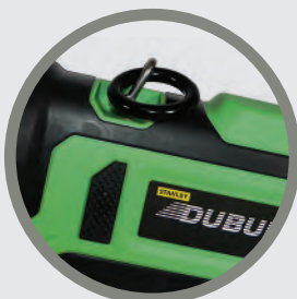
LIFTING RING FOR EASIER CARRYING WHILE ON JOB SITE.