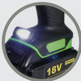
LED LIGHTING OF THE WORK AREA