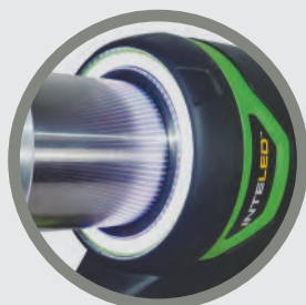
INTELLED™ ILLUMINATION TECHNOLOGY ILLUMINATES WORK AREA AND PROVIDES CRIMP FEEDBACK