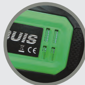
WEATHER RESISTANT PROTECTIVE MEMBRANE ALLOWS ELECTRONICS TO BE VENTILATED WHILE KEEPING WATER, DUST, AND MUD OUT OF THE CRIMPER.