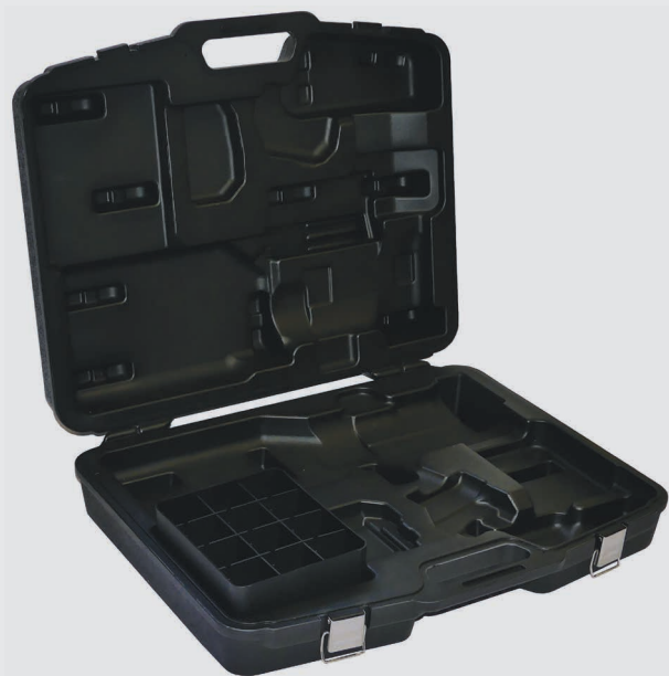
CASE FOR BPP- BCP PISTOL TOOL

To protect and carry the tool, case could receive the tool with its battery, an extra battery, a charger and dies.