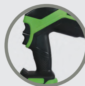
SOFT RUBBER GRIP PROVIDES USER COMFORT AND SECURE HANDLING.