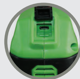
USB PLUG FOR PC CONNECTION