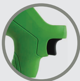
AUTOMATIC RELEASE AT CYCLE END