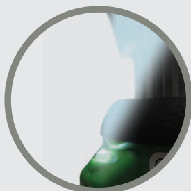
LED LIGHTING OF THE WORKPLACE