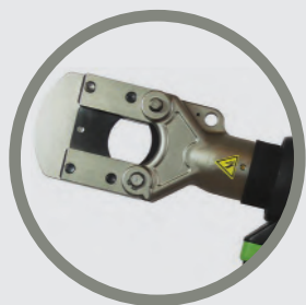
HEADS FOR ANY JOBSITE 5 AVAILABLE OPTIONS