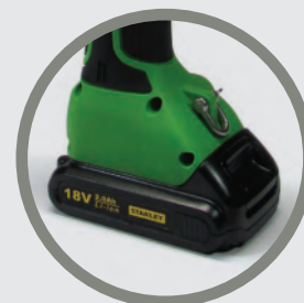
HANDLING RING FOR TRANSPORTATION (STRAP) OR SAFETY CABLE